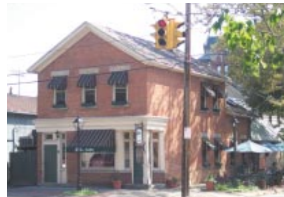
Heck's Cafe #5