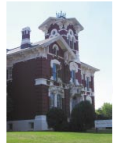
Robert Russell Rhodes House #16