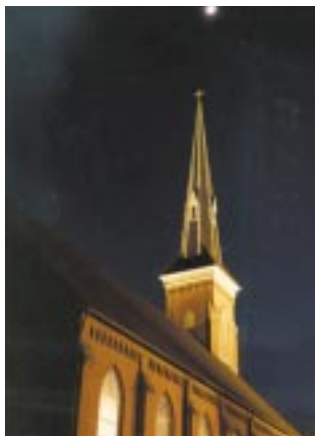
Trinity Lutheran Church #30

Ohio City Near West Development Corporation is a charitable organization dedicated to promoting the livability, diversity and historic heritage of the Ohio City Near West community.