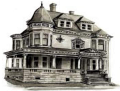
The Marquard Mansion #6