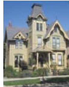
E. F. Pelton House #14

Many of the neighborhood's early houses and commercial buildings still survive. Restoration and rehabilitation, quietly begun in 1969, is ongoing. Ohio City continues to represent the diversity of people, cultures, and building styles which characterize the neighborhood from the beginning. Welcome to an interesting, historic Cleveland neighborhood.